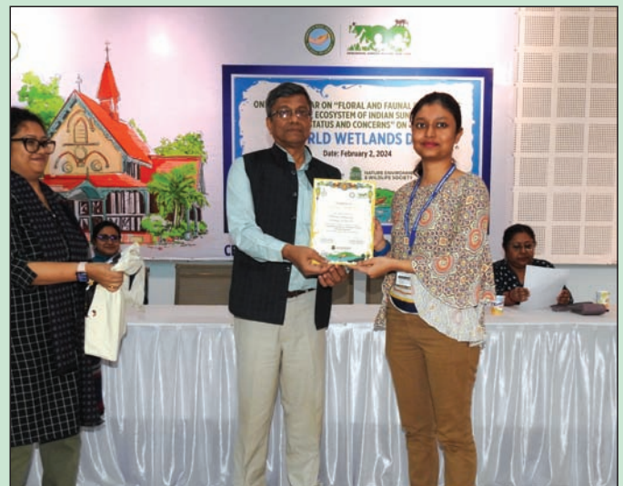
World Wetland Day