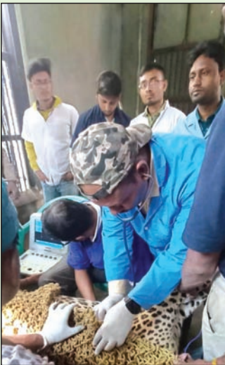
USG of a Leopard (male)