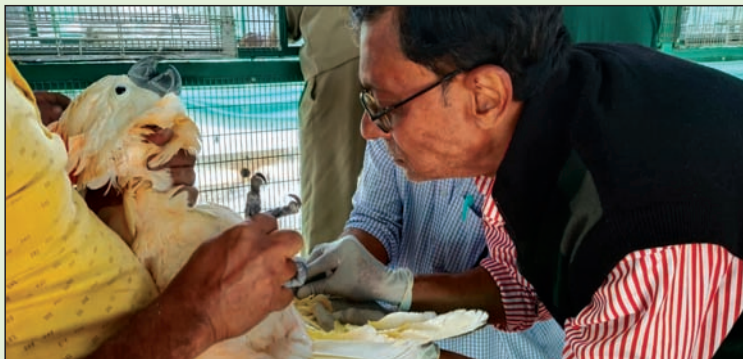
Microbiological Diagnostic work