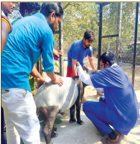
Morphometric analysis of newly arrived Tapir (Male)