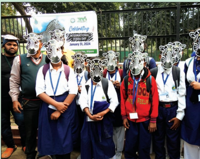
International Zebra Day Celebration