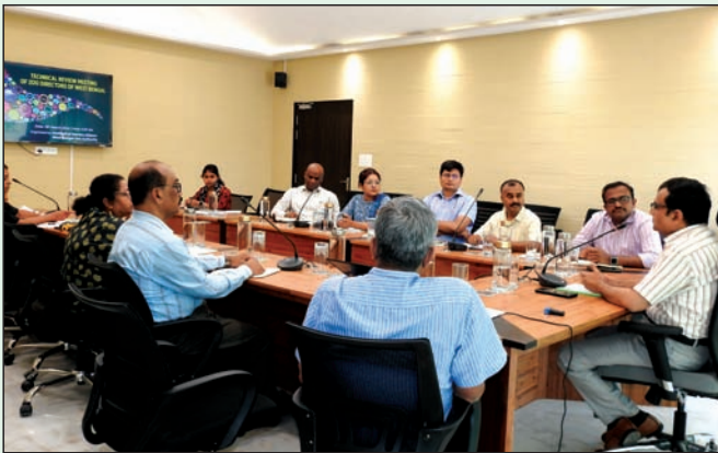
Technical Review Meeting of Zoo Directors of West Bengal

State Zoo Directors' meeting of West Bengal Zoo Authority was held on 28 th March,2024 at Conference Hall in Alipore Zoo. Various technical issues were discussed in this meeting for betterment of the zoos of West Bengal.