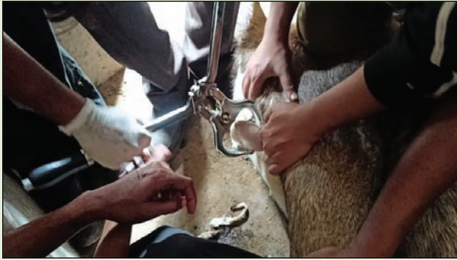
Closed method castration of a Nilgai