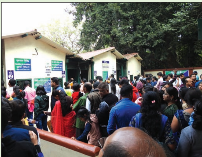
Various types of signage to manage the crowd during peak season.

The Zoological Garden, Alipore experienced maximum footfall of visitors between 15th December, 2023 to 31st January, 2024 as usual like previous years. The Zoo Garden Authority made the following arrangements for better management of crowd and comfort and better experience for the visitors-