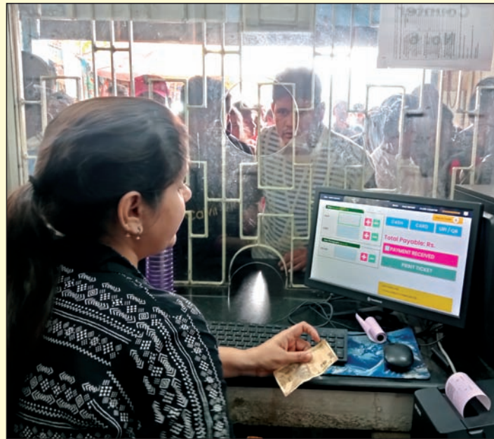
Computerized ticketing system