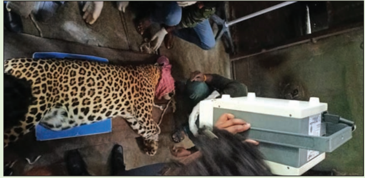
X-ray of a Leopard (Male)