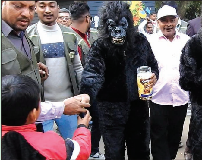
Programme on 1st January celebration