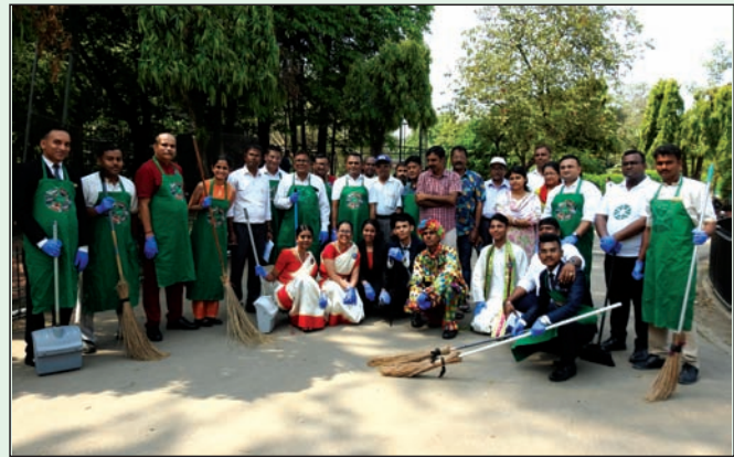
Cleanliness Drive programme by Taj Bengal at Zoological Garden, Alipore