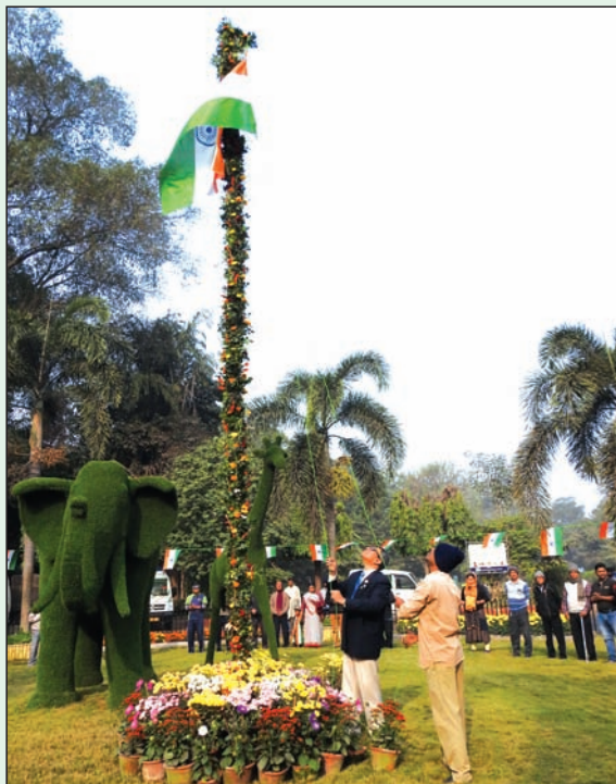
Celebration of Republic Day