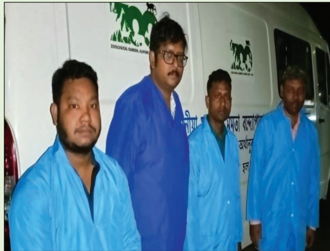
Visit of Zoo Veterinary team at Digha, WB for health monitoring of aquatic fauna