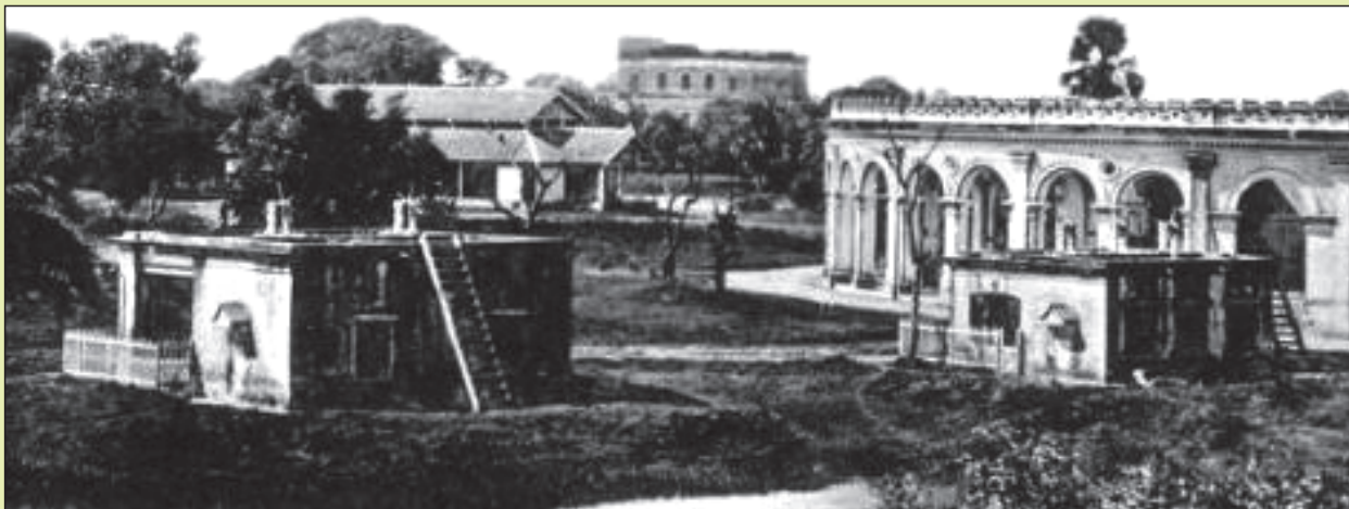
Zoological Garden, Calcutta, 20th Century