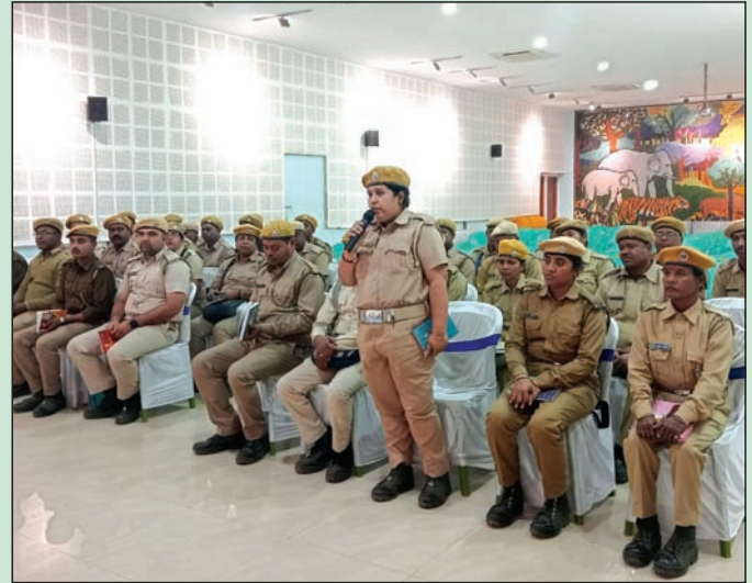
Forest Guard trainees from SFTI, Hiji