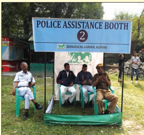
Police Assistance Booth