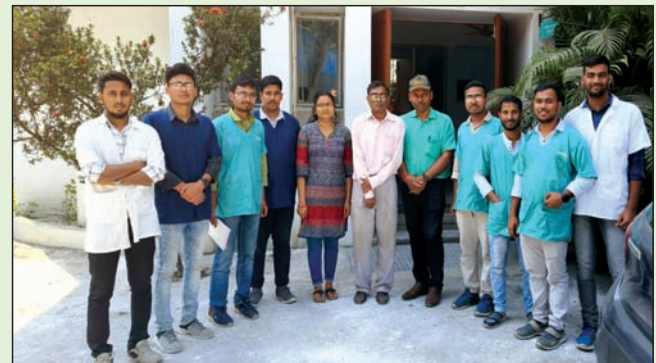
Internship training programme of Veterinary students at Zoo Veterinary Hospital