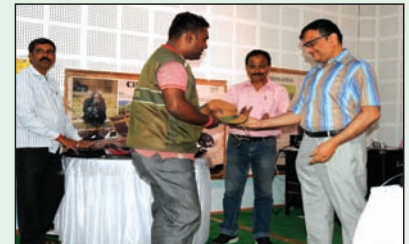
Staff Appreciation Programme