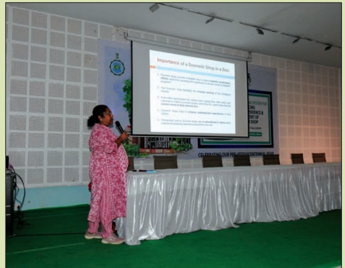
Training on Management of Souvenir Shop