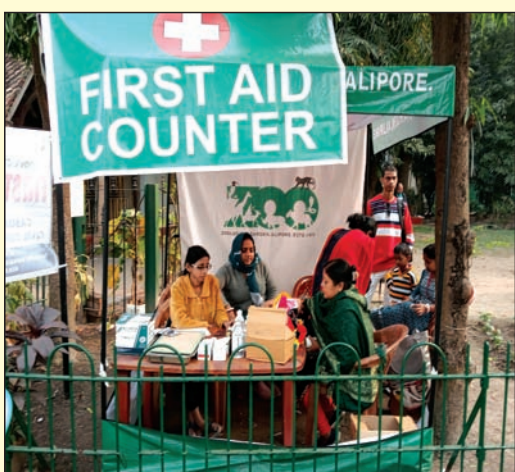
First Aid Counter