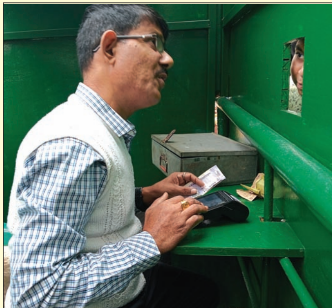
Ticket through POS Machine