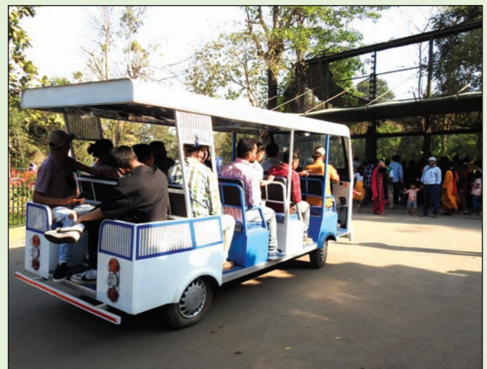
Battery operated cart for visitors