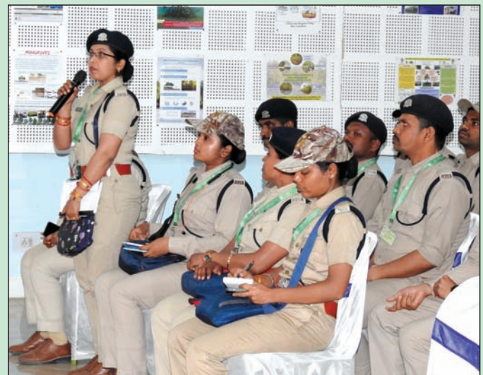
Forest Range Officers trainees, Himachal Pradesh Forest Academy, Sundernagar