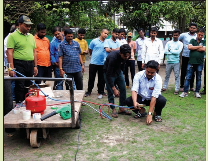
Training on 'Disinfection Procedure and Fire Fighting'