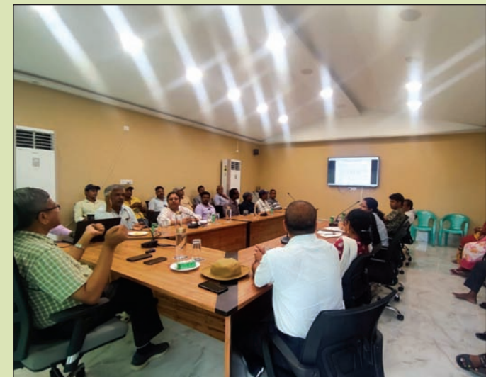
Training on 'Preparation of Compost and Vermicompost from Zoo waste'