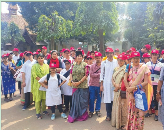
Educational programme for special children