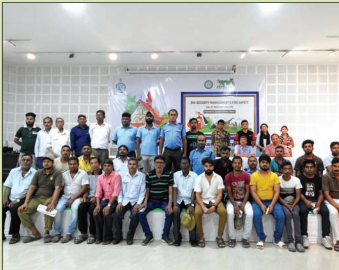
Training on 'Bio-Security Management and Fire Safety'