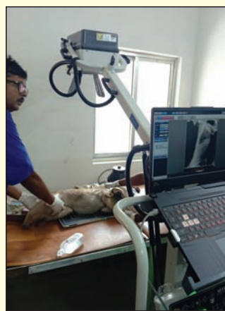
Digital X-ray machine