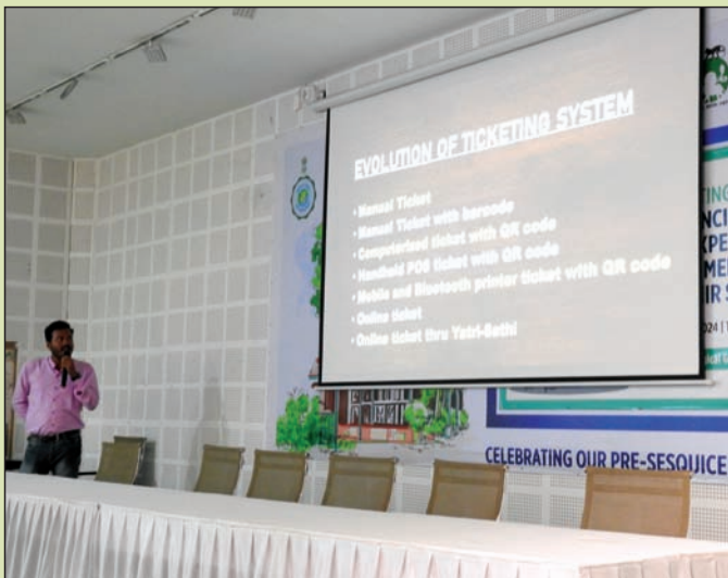
Training on 'Modified Ticketing System for enhancing Visitors' Experience