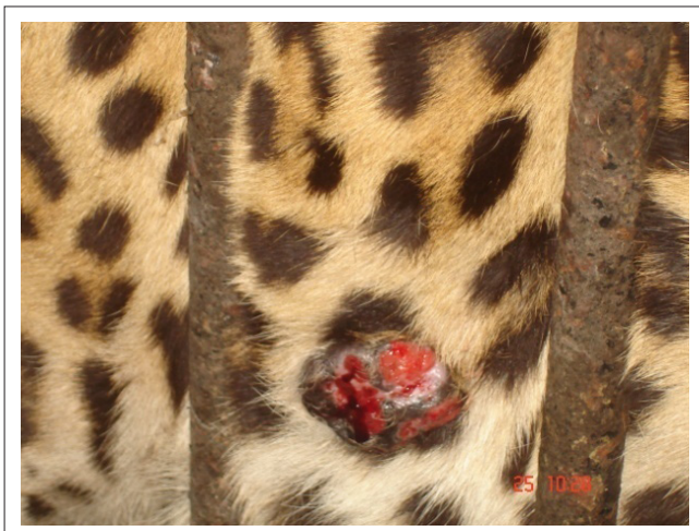
FIGURE 1: Cutaneous growth on right lateral flank with non-healing type of wound.

s.d., Standard Deviation; gm/dL, gram per 100mL; 10^3/\mu\text{L} , per microlitre; mg/dL, milligram per 100 mL