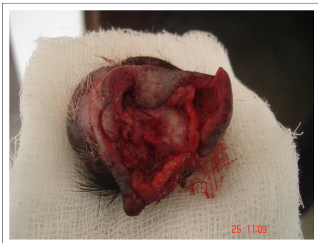
FIGURE 2: The excised growth.

a crush, exposing the area for surgery. The area was prepared for excision and infiltrated with 2% lidocaine (Xylocaine 2%, Astra Zeneca, India). The animal was maintained on intravenous fluid (normal saline, Aravind, India) throughout the process. Routine surgical procedure was followed for complete tumour excision (Morrison 2002). The animal was