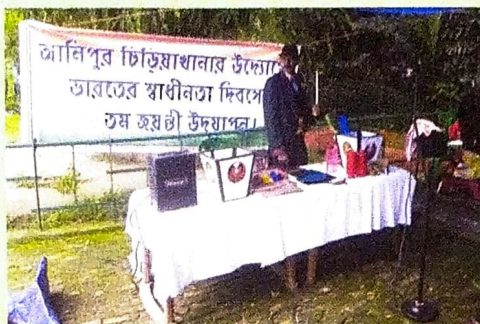
Awareness through Magic Show organized by ZGA