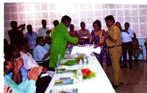
Sri Binoy Krishna Barman, Hon'ble Minister In Charge, Forests, Govt. of West Bengal felicitating Zoo Keeper