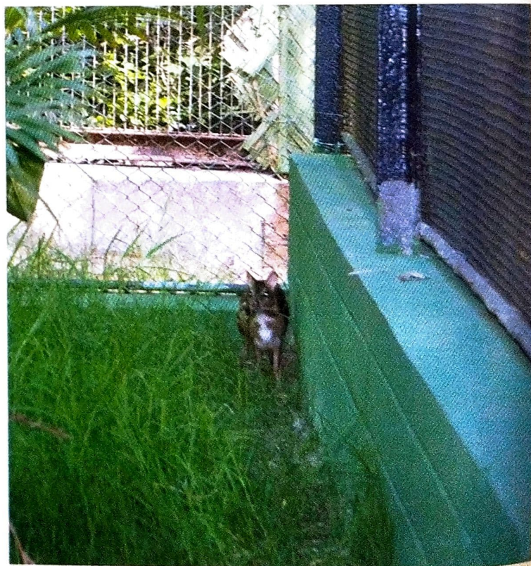
A Mousedeer offspring was born in the month of September, 2018