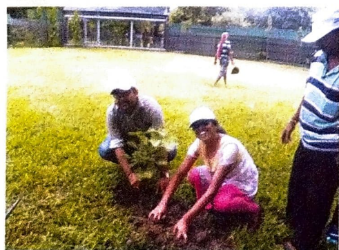
Plantation inside the Kangaroo Enclosure