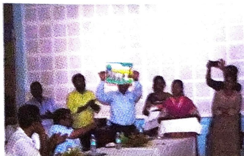
Painting of the winning student