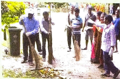
Cleanliness Drive by Officials and Staff of ZGA