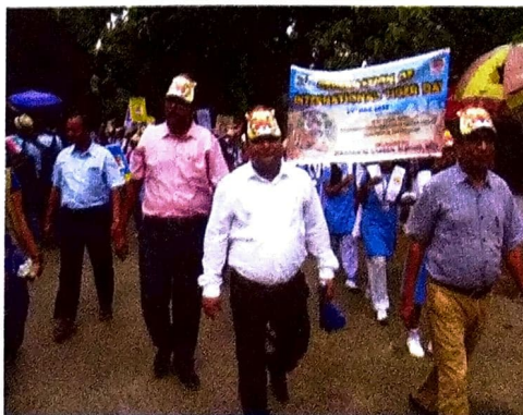
Procession with banners by participating students, Zoo Officials and Staff