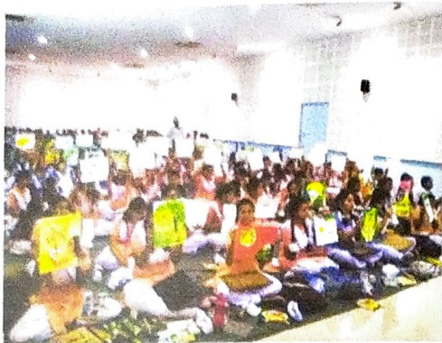
Students with their creative works on tiger conservation