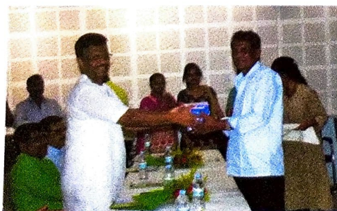
Janab Firhad Hakim, Hon'ble Minister in Charge, Urban Development and Municipal Affairs Department, Govt. of West Bengal felicitating the keeper of Zoological Garden, Alipore