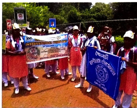
Participating students with banners and placards for Tiger Day