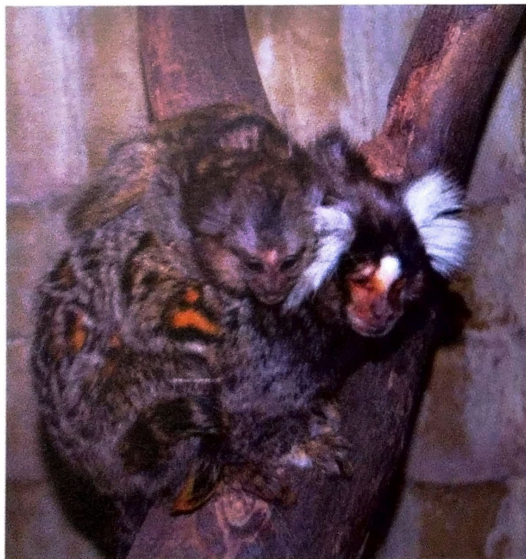
A Marmoset offspring was born in August, 2018.