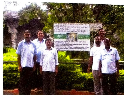
Keepers in front of the Tiger enclosure