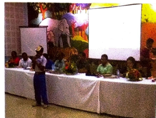
Student participating in the programme