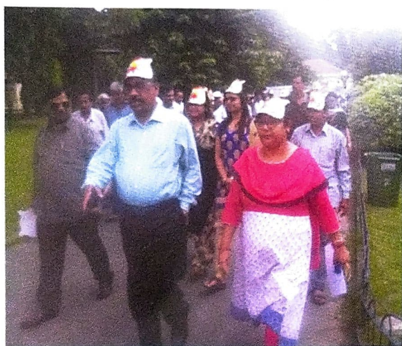
Procession for Tiger Day organized by Zoo officials and Staff