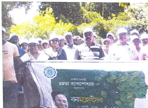
Officials and staff of Zoological Garden, Alipore during a procession for Vanmahotsab

It was heavily raining on the day, but the staff were very much enthusiastic about the programme. The sapling planting went on for the entire day till it was impossible to work for the rain. About 500 saplings of different species were planted in the zoo at many places. The Day was celebrated to make people more aware of the value of the trees and with hope that the saplings planted today will grow into big trees and help the environment.