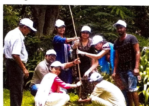
Staff of ZGA gathered for the tree planting in the Tiger enclosure