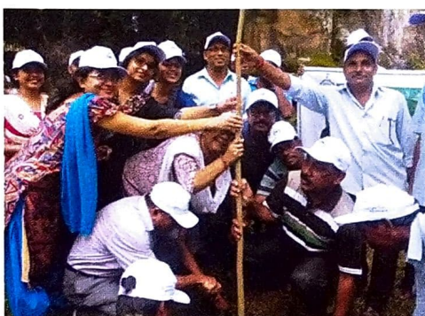
Officials of Zoological Garden, Alipore during the plantation programme in the Tiger enclosure