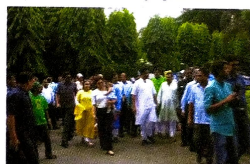
Janab Firhad Hakim, Hon'ble Minister In Charge, Urban Development and Municipal Affairs Department, Govt. of West Bengal, and Sri Binoy Krishna Barman, Hon'ble Minister In Charge, Forests, Govt. of West Bengal joining the celebration