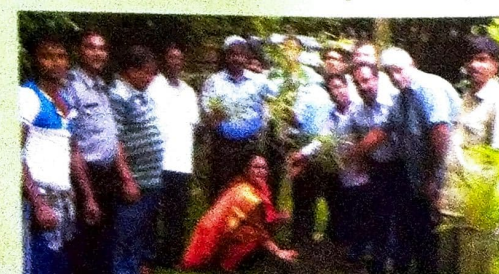
Independence Day Celebration by Plantation