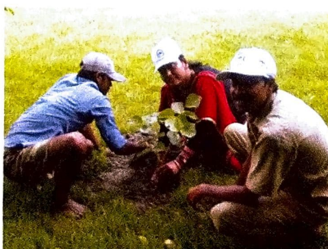
Staff of ZGA helping each other during tree plantation in the Kangaroo enclosure