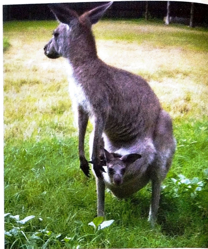
In August, 2018, the Zoological Garden, Alipore welcomed a new member in the Kangaroo family. A Joey was born under the supervision of the keepers in this month.