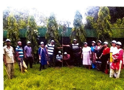
Officials and Staff of the Zoological Garden, Alipore in the kangaroo enclosure for Vanmahotsab