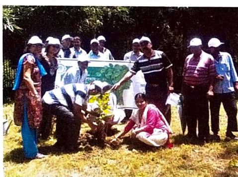
Spreading the message of the necessity of planting trees through plantation and banners