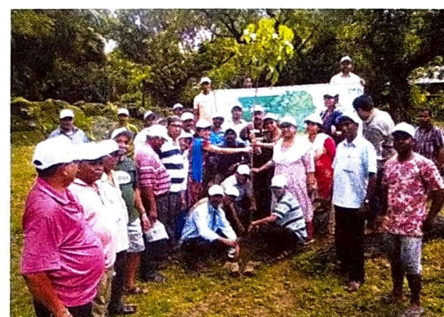
Staff of ZGA gathered for the tree planting programme in the Tiger enclosure