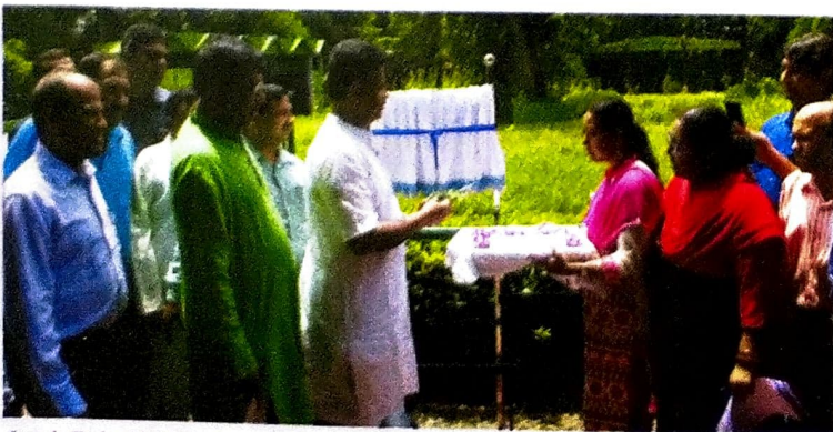
Janab Firhad Hakim, Hon'ble Minister In Charge, Urban Development and Municipal Affairs Department, Govt. of West Bengal, and Sri Binoy Krishna Barman, Hon'ble Minister In Charge, Forests, Govt. of West Bengal inaugurating the Elephant Enclosure