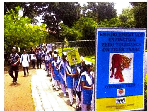
Participating school students with placards during the procession