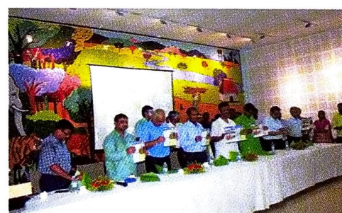
Opening of the Newsletter