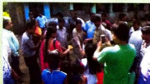
Staff of Zoological Garden, Alipore during sweet distribution