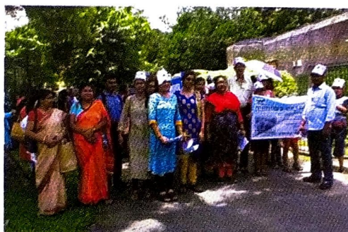
Procession with banners on Elephant Day