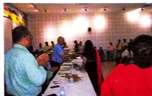
Felicitation of the keepers