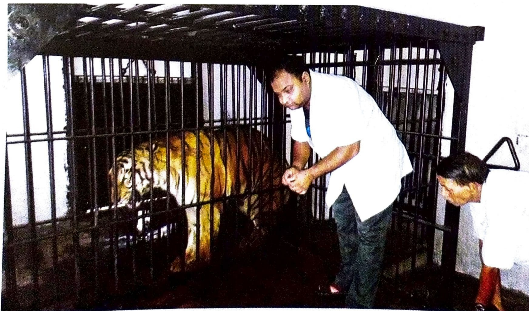
The Veterinary Officer and the keeper during the treatment of the Tigress

4. The normal coloured tigress Rani was found to be wounded and partial anorexia was observed. It was reported to the Veterinary Officers by the keepers and immediate action was taken. Anti-septic cream and lotion was applied on the lesion on regular interval. Anti-biotic course and Vitamin B-complex was also given via injection. After proper care for a few days, the tigress recovered from the wound and transferred to the enclosure.