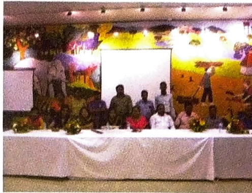
Zoo Officials and Staff in the programme