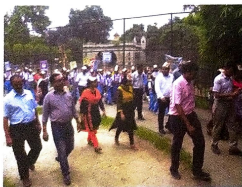
Procession for Tiger Day