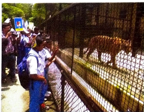
Students enjoying the sight of the tiger