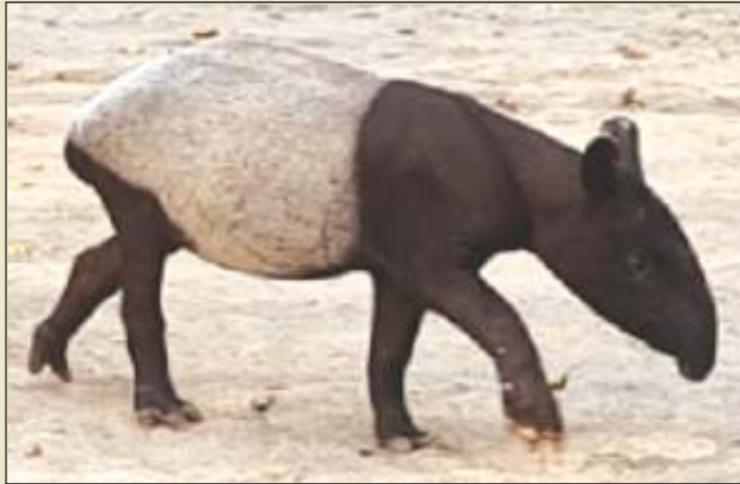
Fig.1 Left- The Brazilian Tapir in the Garden of Calcutta Zoo, Middle- The sketched image of a Hairy Tapir, Right- Malayan tapir at present time, Zoological Garden, Alipore.

its 150-year-old trend of exhibiting tapir. You can see it now in the Enclosure No. 20.