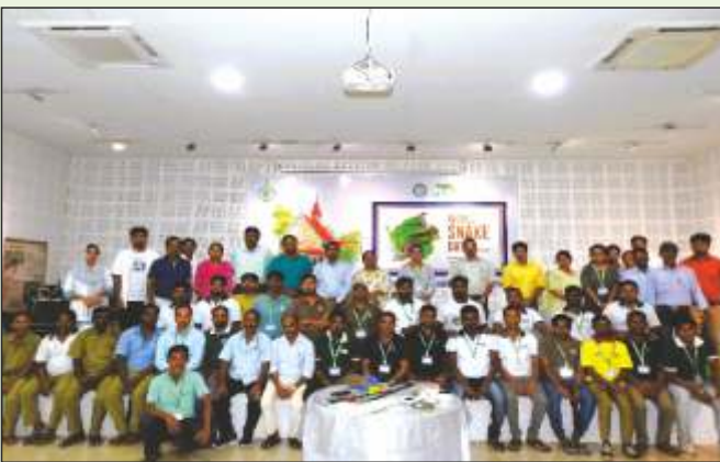
Celebration of World Snake Day