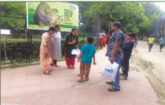
Spot quiz for visitors on World Lion Day