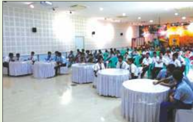
Glimpses of 6th Zoo Festival, 2024