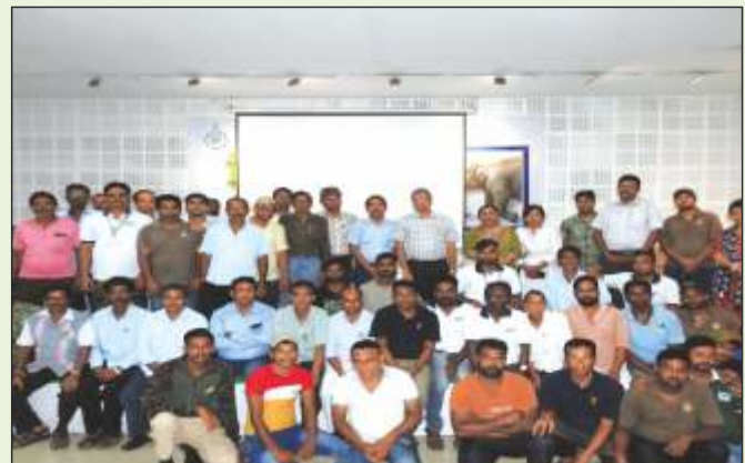
One-day training programme on 'Elephant Management in captivity'