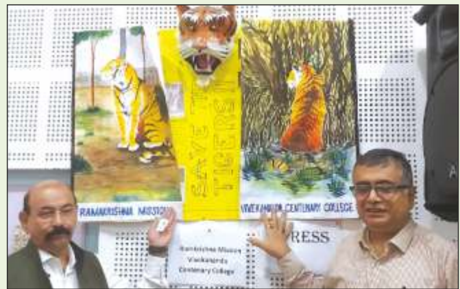
International Tiger Day