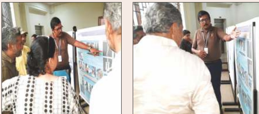
Poster presentation in the national workshop at AAZP, Chennai