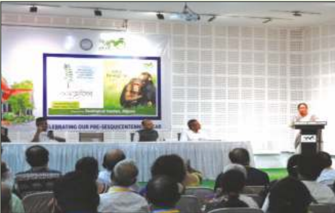
Celebration of World Chimpanzee Day and Ban Mahotsav

The event included various activities, such as a zoo visit, the felicitation of rhino keepers, the adoption of a rhino by Team IOCL and prize distribution along with associated programs. The program concluded with the message: "Save Rhino, Save Ecosystem."