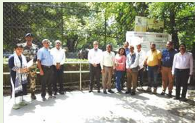
Celebration of World Rhino Day