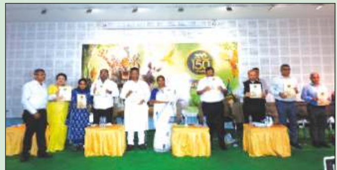
Celebration of 150th birthday of Zoological Garden, Alipore