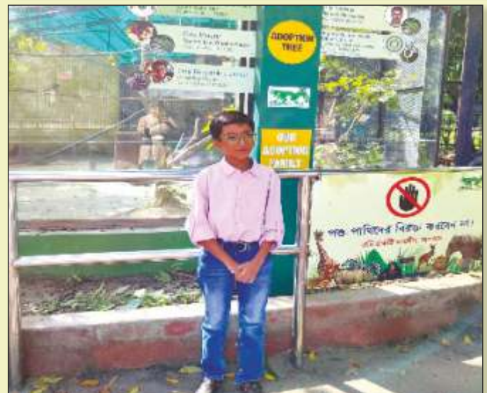
Our Happy Adopters