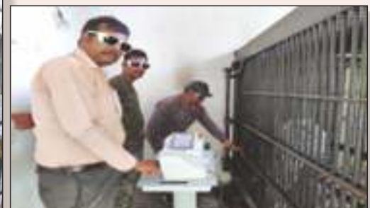
Laser therapy in zoo animals