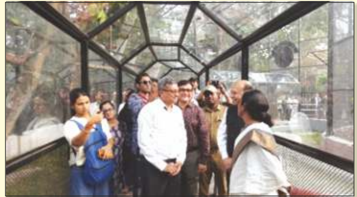
13th December : IFS Probationaries Visit