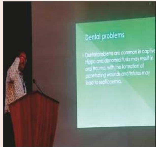
Oral presentation at national congress of ISVS