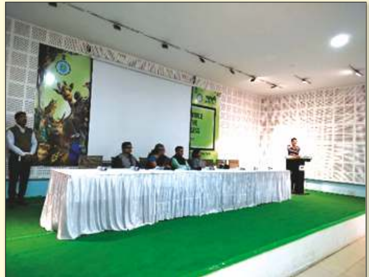
14th December: Collaborative Organization of a seminar cum workshop on 'Recent Developments in Wildlife Management and Treatment' with West Bengal Zoo Authority